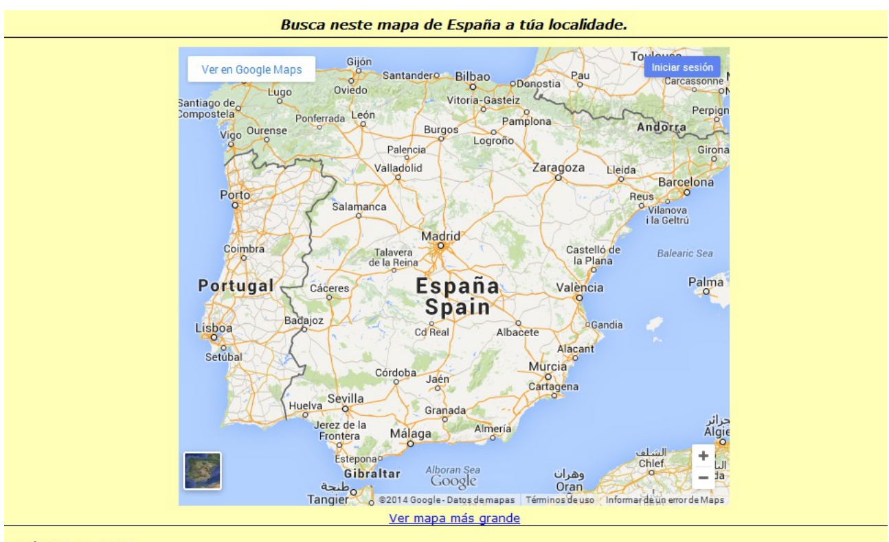
José M. Boo - 2015

This multimedia Ardora activity offers an easy way to paste that code and using the content in a few minutes: