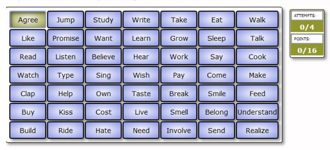
Try to find the exit by clicking the stative verbs in this maze. The first one is done for you:

In the example on your right there is a path from the first cell "Agree" to the final one "Realize".